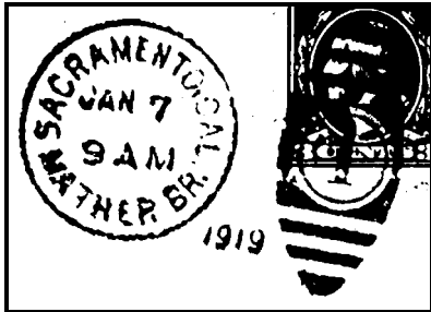
Handstamp of Sacramento, California, Mather Branch